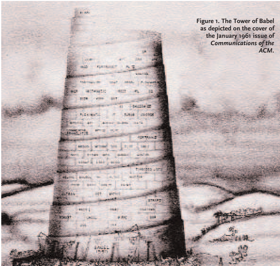
Figure 1. The Tower of Babel as depicted on the cover of the January 1961 issue of the Communications of the ACM .

ming language history and development. 4